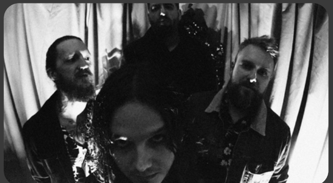
DEATH OF ME