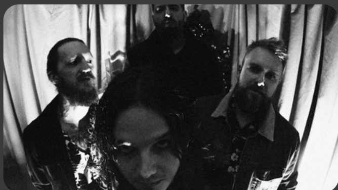
DEATH OF ME