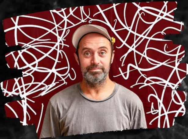
BEANS ON TOAST

LISTEN ON SPOTIFY, APPLE PODCASTS, YOUTUBE, GOOGLE PODCASTS, AMAZON MUSIC, CASTBOX, DEEZER, RADIO PUBLIC, POCKET CASTS & MORE!