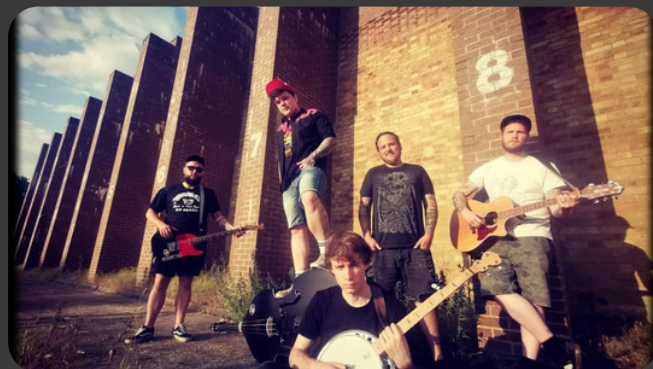
THE CAIN PIT