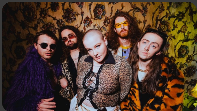
GEN AND THE DEGENERATES